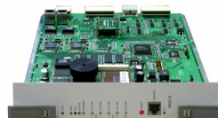
System Processor Board